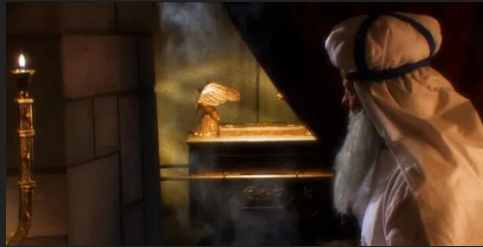
The Most Holy Place