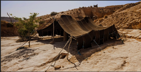
The Tent of Meeting