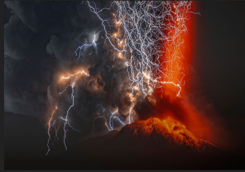
The Smoking Mountain