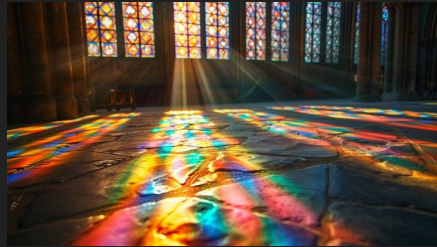
The New Jerusalem