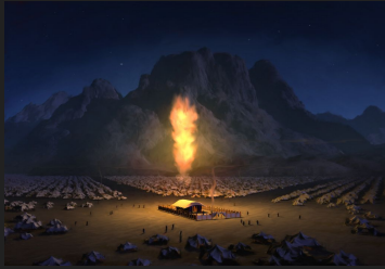
The Pillar of Cloud and Fire