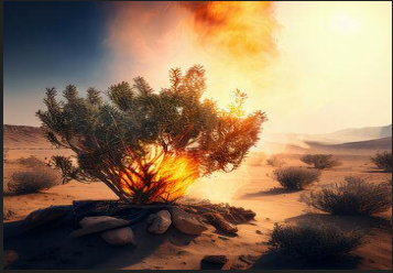
The Burning Bush